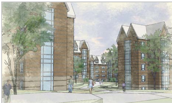
Architect's rendering of North apartment buildings